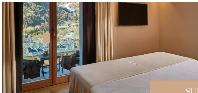
SUITE MONT BLANC VIEW

The feel is both modern and inspired by nature and tradition, with wood, stone and pastel fabrics. In the bathrooms the wood and stone surfaces create a welcoming feel, while the soft lines of the furnishings call to mind pebbles smoothed by mountain streams.