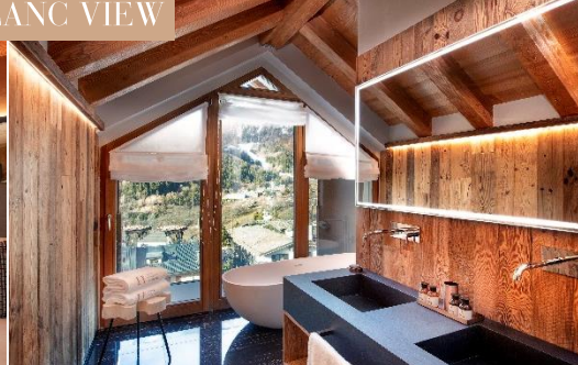
4 Roof Top Suites Mont Blanc View 50-60 sqm