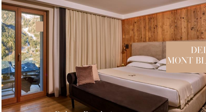
DELUXE MONT BLANC VIEW

Junior Suites at Le Massif offer space, elegance and comfort. Wood makes the rooms feel warm and welcoming, while stone reflects the natural mountain landscapes. Streamlined style features throughout, in a setting which marries Italian design with Alpine traditions. The bathrooms are home to the warmth of natural materials, the colour of wood, and the soft, stylish lines of the furnishings.