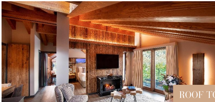
ROOF TOP SUITE MONT BLANC VIEW